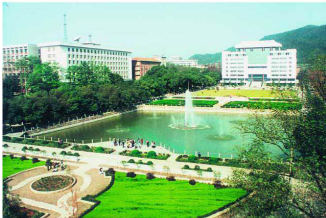
Central South University (CSU) Campus

Weather in Changsha during October is warm: 20°C~30°C. It may rain a few days a week. It is recommended to carry an umbrella.