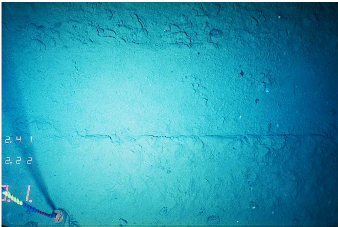
Fig. 3 An example seafloor photo taken 1 year after JET disturbance. Top part is a sediment recovered area with the hydraulic suction device. Middle part is a sledge track, 60 cm in width, of the disturber. The bottom is a piled and re-deposited area beside the sledge track. JET disturbance was taken place from the end of August to the beginning of September 1994 at 9°16.7' N–146°15.5' W.

Japan's deep-sea impact experiment (JET, 1994–97) was conducted by MMAJ (Metal Mining Agency of Japan), using the DSSRS, in the Pacific Ocean's CCFZ in 1994. Disturbance was created during 19 transects over 2 parallel tracks 1600 m long (Fukushima, 1995). The impact was assessed from sediment samples, deep-sea camera operations, sediment traps and current meters. Results (Fig. 3) show that, while the abundance of meiobenthos decreased in deposition areas immediately after the experiment and returned to original levels 2 years later, the species composition was not the same; in addition, the abundance of certain groups of mega and macrobenthos was still lower than in the undisturbed area (Shirayama, 1999). This observation further establishes that certain groups are more susceptible than others in adapting to changed conditions on the seafloor.