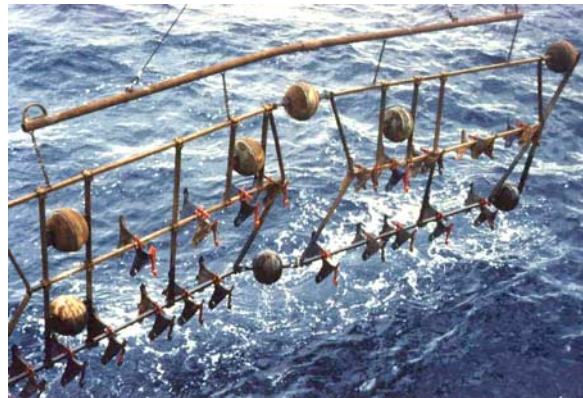
Fig. 1 The plow harrow used during the German large-scale DISCOL-Experiment in 1989 to create a disturbance on the seafloor comparable to a future manganese nodule mining.

The DIS turbance and Re- COL onisation (DISCOL) experiment was conducted by the scientists of Hamburg University, Germany in the Pacific Ocean's Peru Basin during 1988–98. Collection of pre-disturbance baseline environmental data was followed by the disturbance caused by a plow harrow (Fig. 1) in a circular area of 10.8 km 2 (Foell et al., 1990) at 88° W–07° S in the Southeast Pacific Ocean. Post-disturbance studies were carried out to monitor the impact and re-colonization after 6 months, 3 years and 7 years, using sediment cores, deep-towed photographic systems, current meters and nephelometers. The results have shown that over a period of time, although certain groups of benthic organisms may show a quantitative recovery, the faunal composition is not the same as the undisturbed one (Schriever et al., 1997). This implies that complete re-colonization is a slow process and some of the benthic organisms may need more time to re-establish themselves in the disturbed areas in terms of density and diversity. The ATESEPP (German abbreviation of Impact of technical interventions into the deep sea of