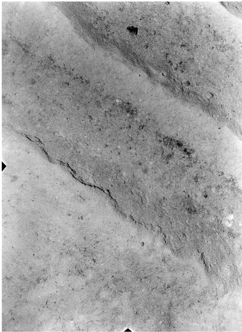
Fig. 4 Track 4. Sea-bed image obtained by Neptun deep-sea camera system within IOM BIE test site during monitoring survey in 2000 (5 years after disturbance operations). Photograph shows re-establishment of the bottom within disturber tracks at 2 \times 1.5 -m site, 119^{\circ}41.1' W– 11^{\circ}03.7' N: Continuous Deep-sea Camera (CDC) survey was made from the end of July to the beginning of August, 1995 (From V. Stoyanova, IOM).

A benthic impact experiment (IOM-BIE) was conducted by the Interoceanmetal (IOM) Joint Organization in the Pacific Ocean's CCFZ in 1995, using DSSRS (Fig. 4). In all, 14 tows were carried out on a site of 200 \times 2500 m and the impact was observed from deep-sea camera tows and sediment samples (Tkatchenko et al., 1996). No significant change was observed in meiobenthos abundance and community structure in the re-sedimented area, but alteration in meiobenthos assemblages within the disturbed zone was observed (Radziejewska, 1997; Radziejewska and