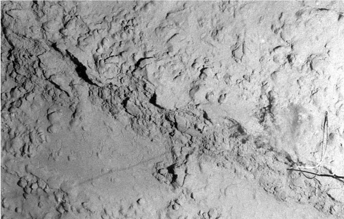
Fig. 6 Disturber track marks and ‘Sediment piles’ made by the movement of the disturber on the seafloor in the disturbed zone, August 1997: 10°01’ S–75°59’ E and 10°03’ S–76°02’ E in the Indian Ocean.

Some of the probable impacts at various levels in the water column are summarized as follows (ISA, 1999).