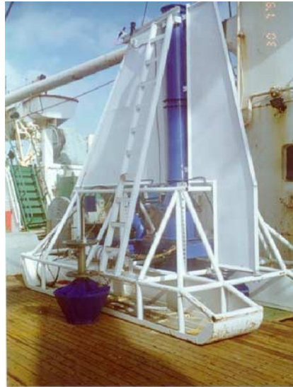
Fig. 5 Benthic disturber “deep-sea sediment re-suspension system” used for the experiment.

Modlitba, 1999). This indicates that the intensity of disturbance and the proximity to the site could have variable effects on the composition of the faunal assemblages.