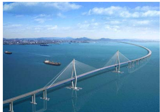
Figure 2. Overview of Incheon Bridge, South Korea. The dolphins are shown around the bridge pillars.

This paper deals with the set up of the model tests and the test results. How Test plan and results had to be incorporated into the design of Incheon Bridge is the subject of a second paper to this conference (Kim et al. 2007).