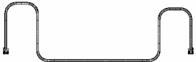
Figure 1a – Typical Jumper Configuration

A typical jumper will have 6 bends, and an unsupported length of 50 to 100 feet. The design of the structure lends itself to having low natural frequencies, and low structural damping. Figure 1 shows a diagram of a typical jumper arrangement.