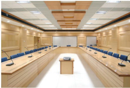
Rajendra Chola Hall

NIOT Campus Route map from Airport (map not to scale)