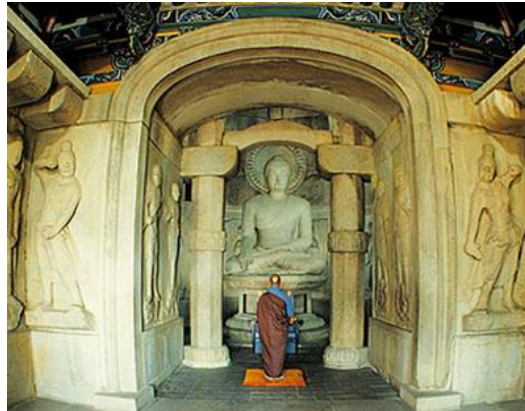
Seokgulam, Gyeongju (UNESCO Cultural Heritage)

AUTHOR INDEX will be posted on www.isope.org .