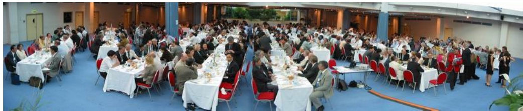
ISOPE-2004 Toulon Conference Banquet Award Presentations: Best Papers, Session Organizer of the Year 2004, Offshore Mechanics Scholarships, and Panoramic View of the Banquet